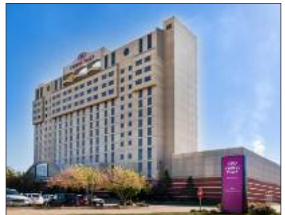
The host hotel, the Crowne Plaza Hotel.

Thursday evening's meal is on your own. Ranging from casual to upscale, there are many venues within a short driving distance from the host hotel for your dining pleasure.