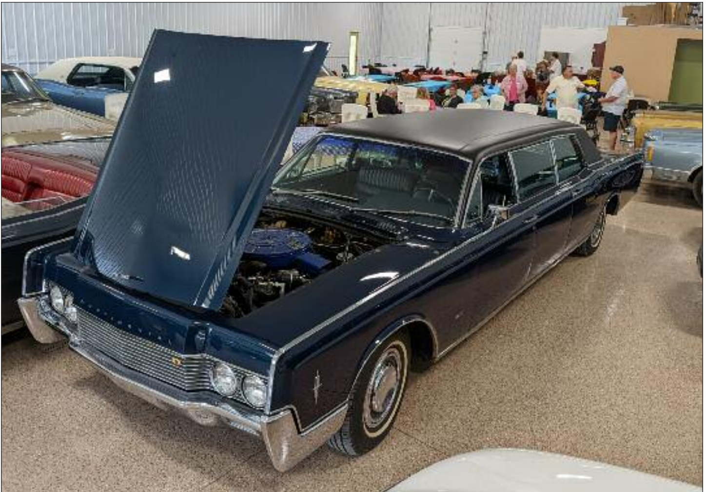
THIS PAGE, CLOCKWISE FROM ABOVE Joe's 1966 Lehmann-Peterson Limousine is a stunning example of mid-1960s formal Lincoln luxury. Formerly of the Kokomo Automotive Museum, this 1949 Cosmopolitan Town Sedan is a rare, low-mileage survivor. The new home of the Columbe Collection exudes class, even in the restroom.