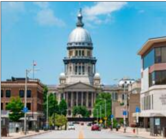
LEFT The Illinois State Capitol building. RIGHT The Frank Lloyd Wright-designed Dana Thomas House.