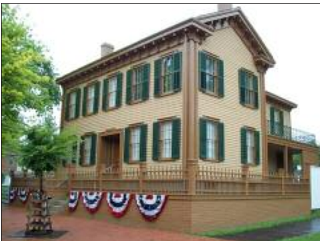
LEFT The Lincoln Home National Historic Site, restored to look as it did in 1860.