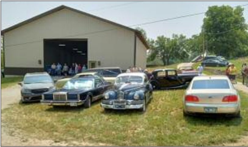
LEFT Cars of all shapes, sizes, and descriptions were present at the picnic this June. Photo by Terence Holmes BELOW T-Birds galore! This Squarebird owner is buttoning up the top for the drive home. Photo by Jeff Shively. BOTTOM Thunderbird set the pace at Indianapolis in 1961. Photo by Jeff Shively.