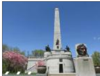
LEFT President Lincoln's tomb in Springfield, Illinois.